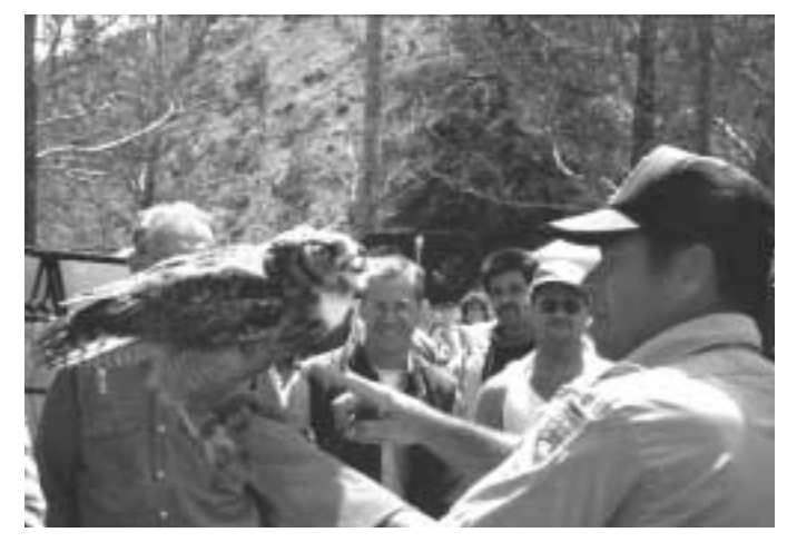
Educational and interactive exhibits are just a few of the events at this year's Bioregions Festival on Saturday in Circle Park.

Broader motives aside, reasons for taking part in the Bioregions Festival are mainly that it's fun, educational, a great spring getaway and maybe even an opportunity to add to your "life list"—be it bird life or getting in touch with LIFE—the vibrant, budding, singing, fragrant festival of the season here in the Kern River Valley. �