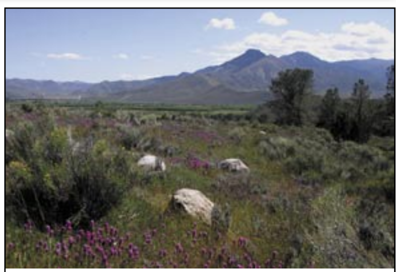
Sprague acquisition looking east from the gray pine/juniper woodland habitat along Fay Creek. Nichol Peak is the mountain in the background.

Audubon staff has worked hard for several years with a diverse group of agencies, organizations, and individuals to acquire this important habitat. Of course, the Sprague family who sold this beautiful property must be properly thanked, without their vision and generosity to protect this