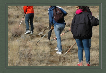
Visit us on Facebook

The Summit Post Is an Outdoor Adventures Club Publication to help keep our supporters informed of our trips and activities.